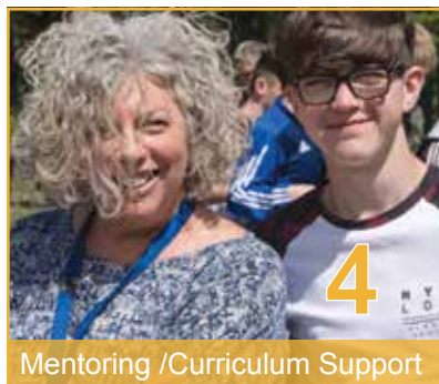
Mentoring /Curriculum Support