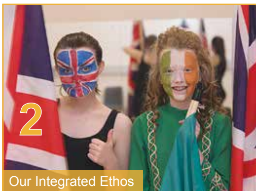
Our Integrated Ethos