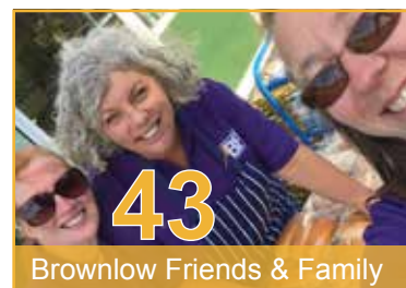
Brownlow Friends & Family