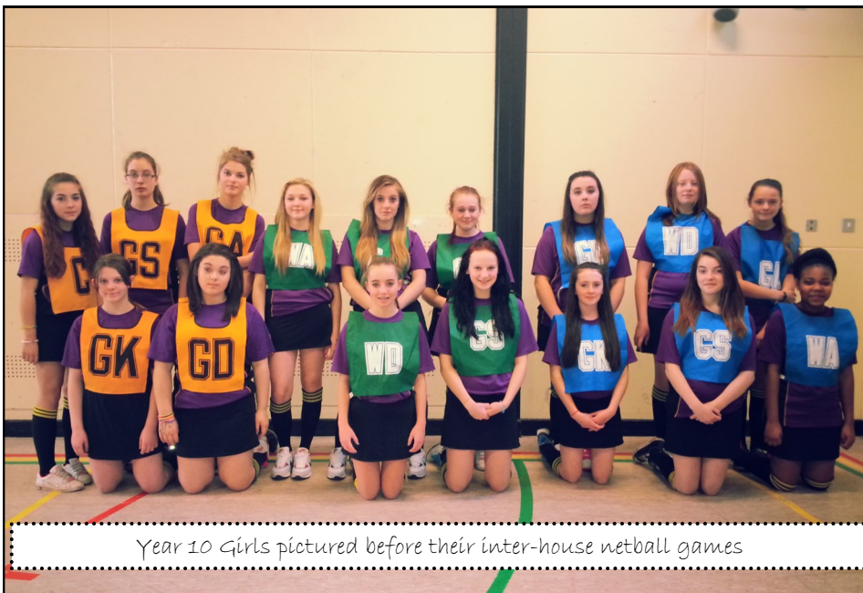
Year 10 Girls pictured before their inter-house netball games