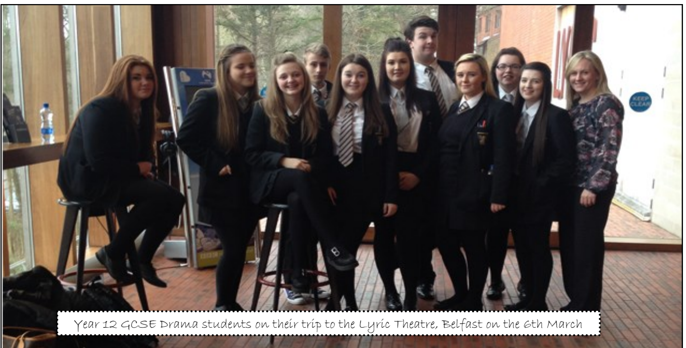
Year 12 GCSE Drama students on their trip to the Lyric Theatre, Belfast on the 6th March