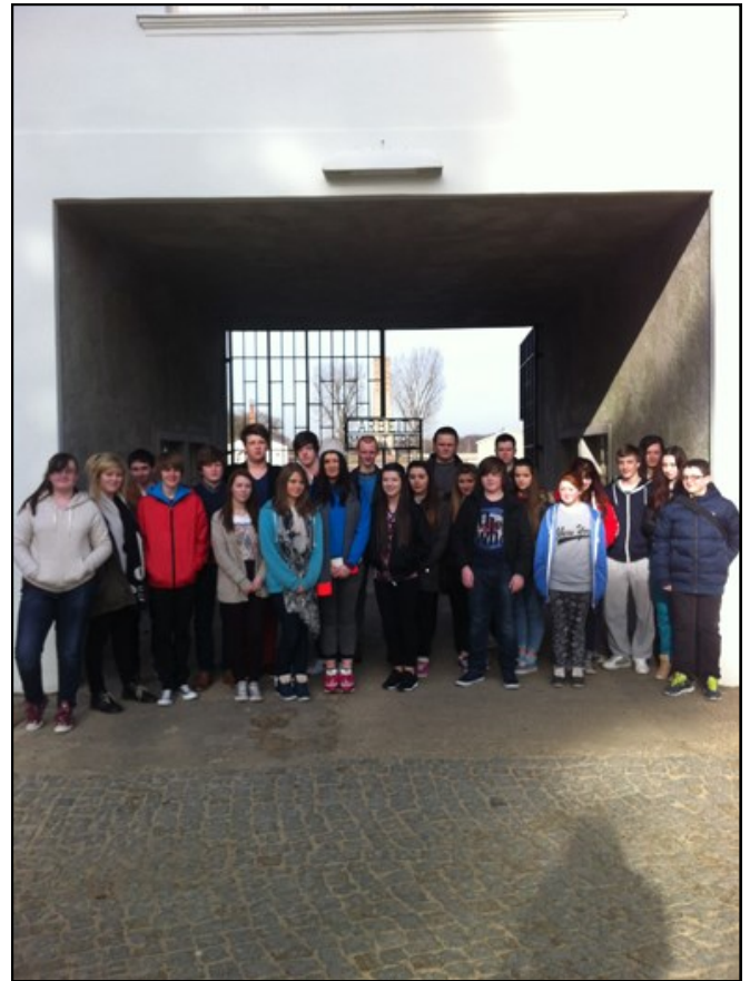
Above: Pupils at a US Army checkpoint and outside the Sachsenhausen Concentration Camp