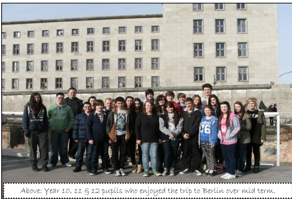
Above: Year 10, 11 & 12 pupils who enjoyed the trip to Berlin over mid term.