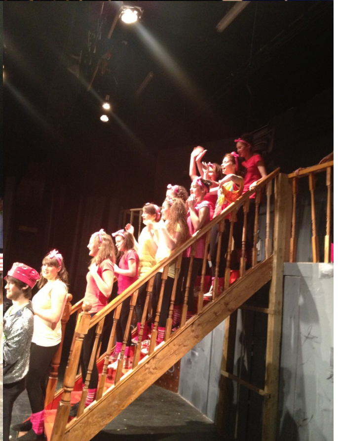
Brownlow Panto Photos